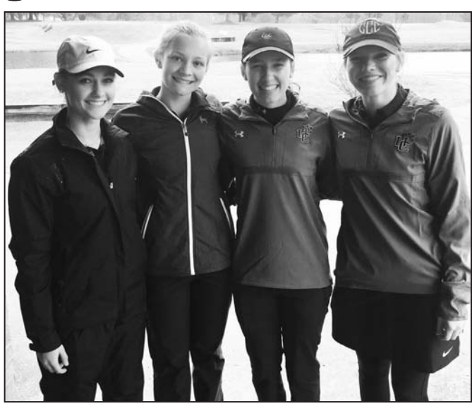
Union County Lady Panthers from earlier in the season. HELEN - The Union County girls golf team edged Gaines- Gainesville placed second with a ville High and White County at 139 and White County was third Innsbruck Golf Club last week.